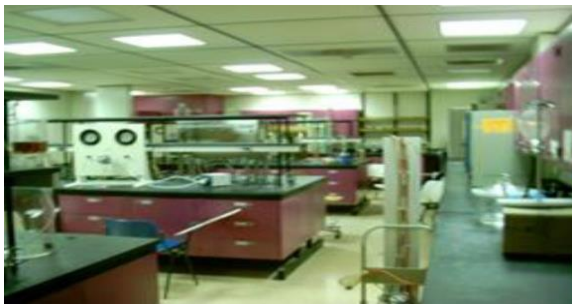
Core Analysis Laboratory

It is equipped with the necessary tools for testing cement used to support casing string and borehole sides. These tests include thickening time at atmospheric and high pressure high temperature conditions, compressive strength under uniaxial and triaxial loadings, shear strength, failure criteria, mechanical and elastic properties of reservoir rocks and set cement.