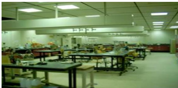
Drilling Fluids Laboratory