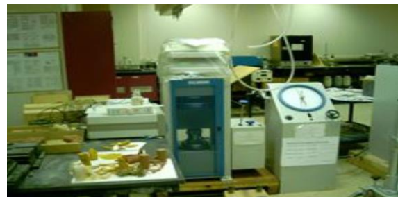
Rock Mechanics and Cement Laboratory